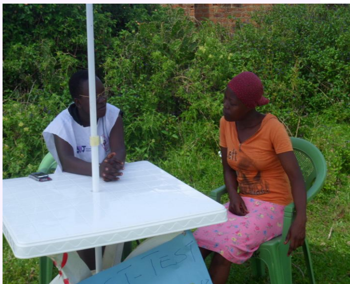
Left to Right: The VCT team from Bumwoni Health Center III carry out HIV testing and counseling on the World AIDS Day,Mercy Grounds-Lwakhakha Town Council, 1/12/2015.